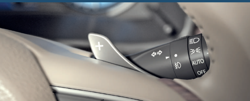
6-Speed AT with Paddle Shifters Surge ahead by engaging the smart paddle shifters.

● Togetherness, driven by technology. The Ertiga is equipped with state-of-the-art technology to add more fun to your moments of togetherness.