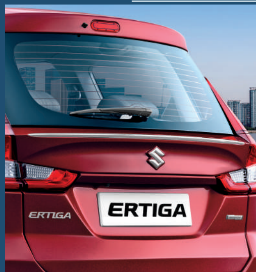
New Back Door Garnish with Chrome Insert Let those second looks chase you.