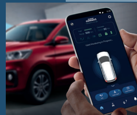
Connected Car Technology with Suzuki Connect Always stay connected with your car.