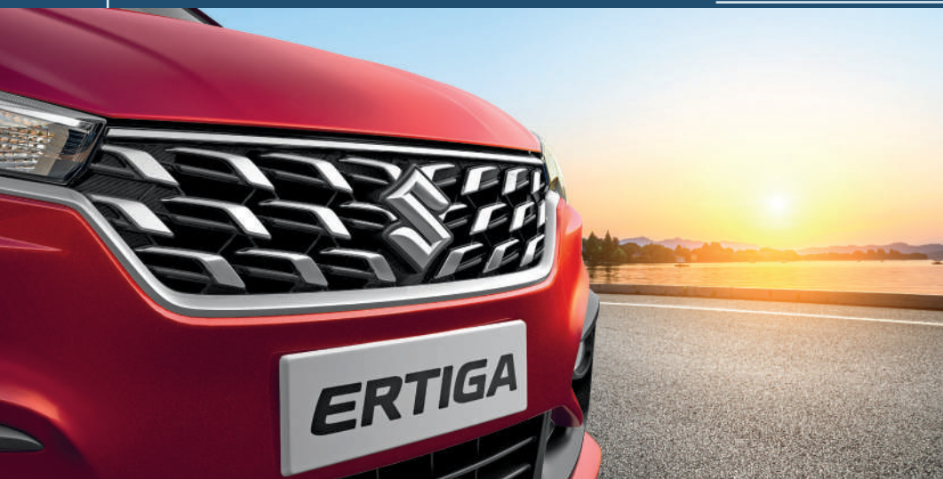
Dynamic Chrome Winged Front Grille The most stylish way to make an entrance.

● Elegant from every angle, the Ertiga is designed to bring out the stylish side of togetherness.