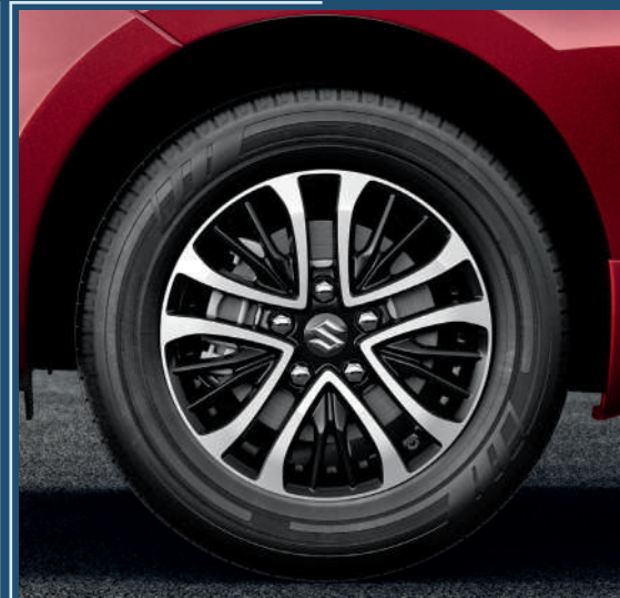
Machined Two-Tone Alloy Wheels Make a statement, every time.