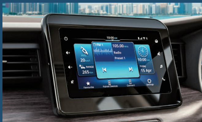
17.78cm Smartplay Pro Connect with your world with just a voice command - "Hi Suzuki".